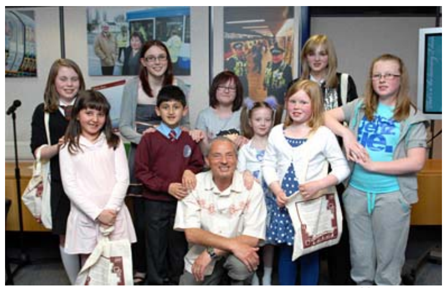
My Dad's Working Boots

Megan's poem, "My Dad's Working Boots", has also been put on display at St Enoch Subway station on the wall of the outer circle platform for two weeks from the 17th of August.